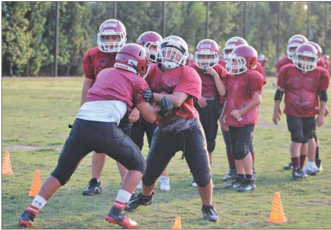
Downey Razorbacks practice at Discovery Sports Complex ahead of their Sept. 11 season opener.