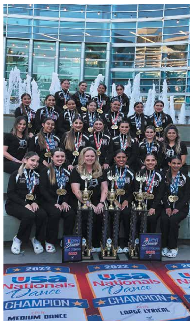
Downey High School's dance team brought home three first place trophies, plus separate second place and third finishes, at the USA Nationals Dance Competition held this weekend in Anaheim.

"It's actually fun and engaging, and also eye-opening for them. I think it's just a chance to see that we're just people too."