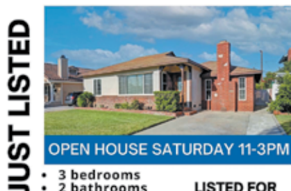
3 bedrooms 2 bathrooms LISTED FOR 1,356 sq. ft 7,163 sq. ft. lot $775,000