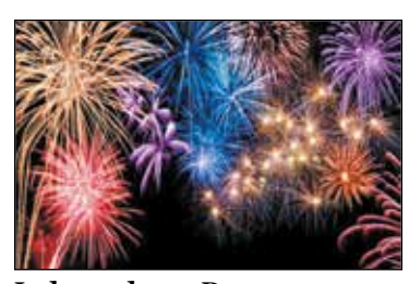
Independence Day Spectacular Sunday, 4:30-9 pm Los Nietos Park in Santa Fe

Springs A free community event featuring a horseshoe tournament, food trucks, live music and fireworks starting at 9