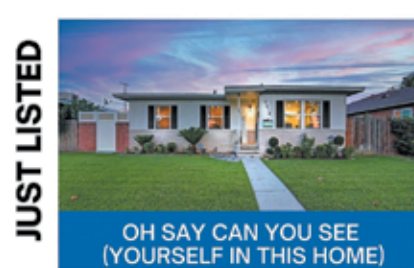
4 bedrooms 2 bathrooms LISTED FOR 1,446 sq. ft. 6,402 sq. ft. lot $875,000