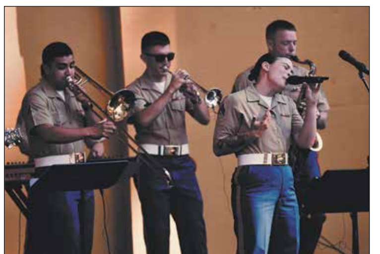
The 1st Marine Division Band will perform Wednesday at Downey's Concert in the Parks series. For details, see page 12.