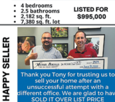
sell your home after an unsuccessful attempt with a fferent office. We are glad to have SOLD IT OVER LIST PRICE