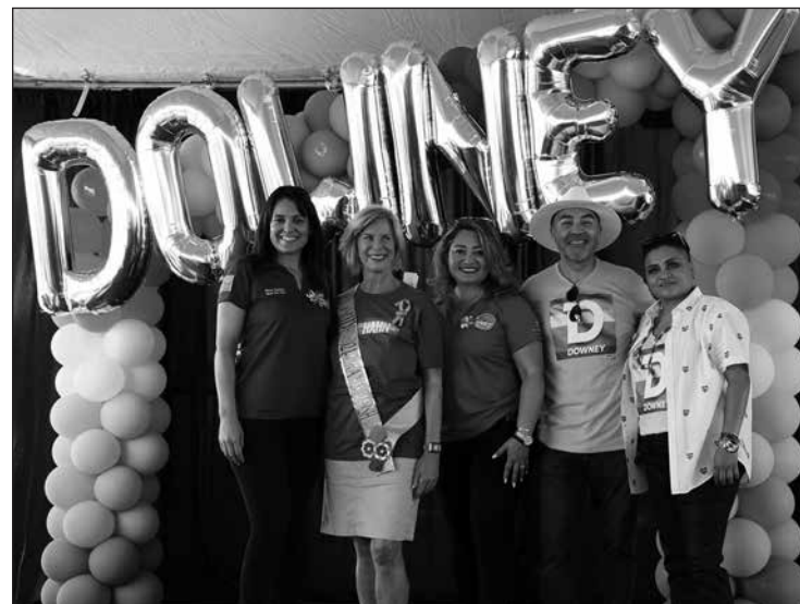
Downey Pride returns this year with two public events. The first event, the Downey Sunset Festival, is scheduled for Friday, Aug. 12, from 5-10 pm in Downtown Downey. The second event, the Downey Family Picnic, is Saturday, Aug. 13, from 12-6 pm at Furman Park.