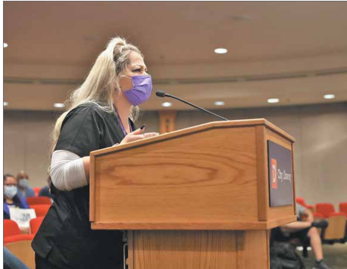
A healthcare worker addresses the Downey City Council on Tuesday.

The ordinance goes into effect 10 days after approval.