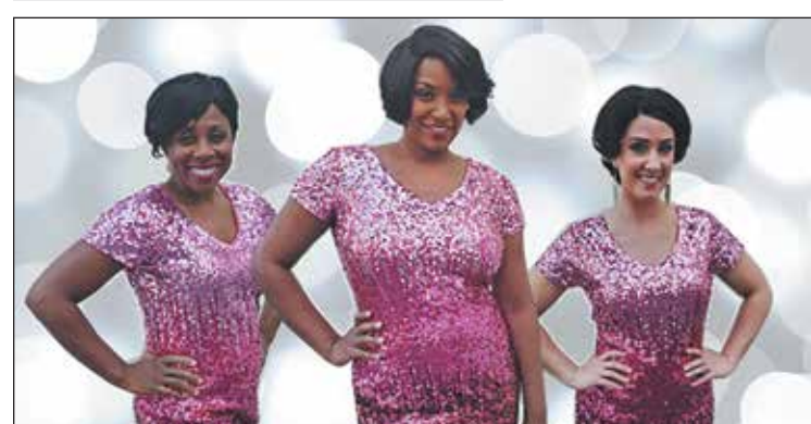
Pop and soul band Soul 3 Sixty performs live Wednesday at Downey's Concert in the Parks series. For details, see page 12.