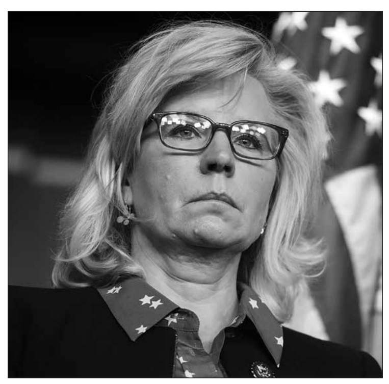
Liz Cheney's defeat Tuesday reflected a changing Republican party.