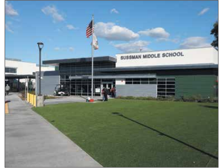
Sussman Middle School will begin its IB program with 100 students starting next fall.