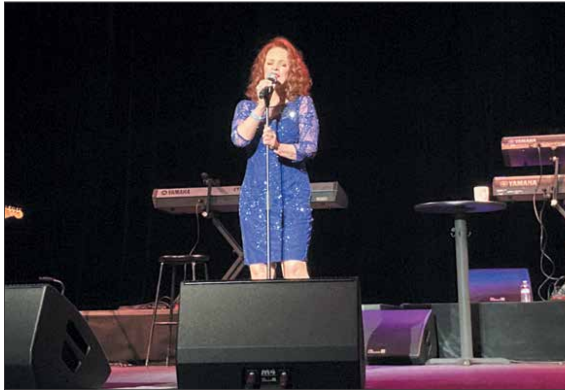
Sheena Easton performs last Saturday night at the Downey Theatre.

In 1988 she was nominated for the “Best R&B Vocal Performance